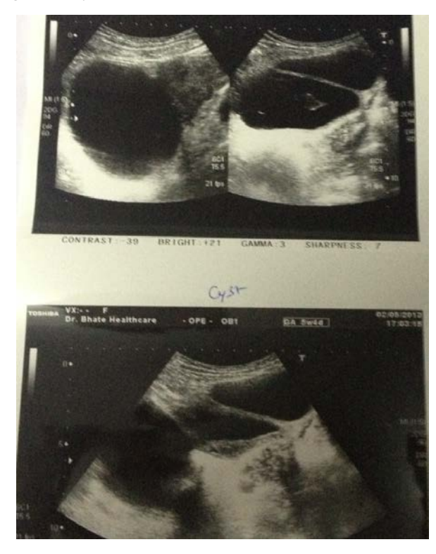
Figure 1. Cyst seen In USG Report

On per vaginum left sided adnexal mass around 7X7 cms .Mobile mass, not seperated from uterus.Tenderness present. Right fornix lump palpable of 5X5 cms.