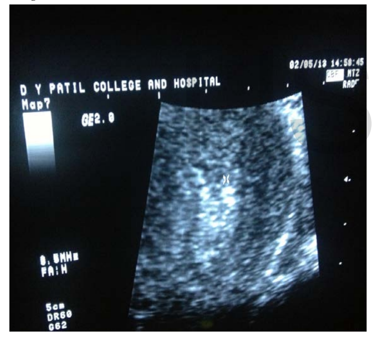
Figure 4. Shows decidual reaction

PREVENTION: Risk of OHSS is reduced by monitoring of FSH therapy to use this medication judiciously, and by withholding hCG medication.